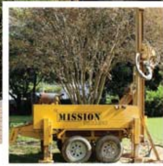
Office: 021 551 7562