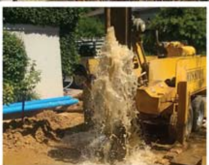
Borehole Drilling & Services